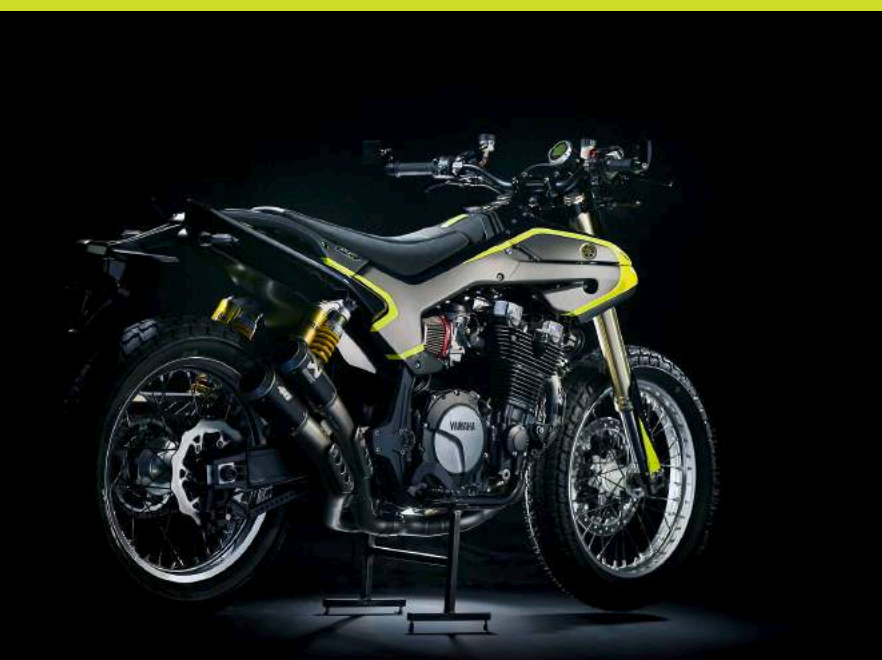
Evolved from the '84 FJ1100, Yamaha's old-school air-cooled four makes for one seriously big flat tracker

Yamaha's sizeable XJR1300 might not appear the natural candidate for a flat track racer. But that's pretty much the point behind MYA, the 1251cc inline four created for Valentino Rossi – perhaps the greatest motorcycle racer of all time.